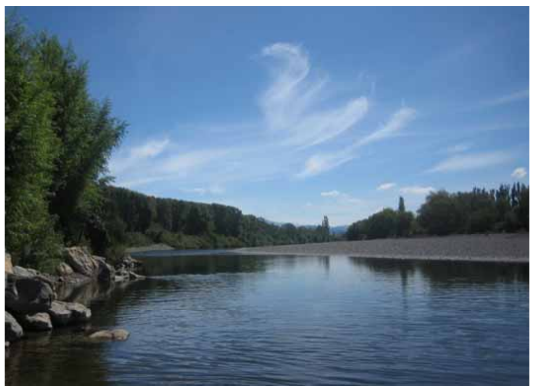
Figure 2.2: Waiohine River downstream of the rail bridge (top photo) and downstream of the SH2 bridge (bottom photo)