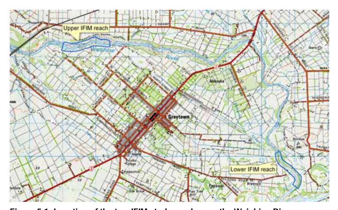
Figure 5.1: Location of the two IFIM study reaches on the Waiohine River

Two sections of the Waiohine River, each about 1.1 km long, were selected for instream habitat modelling: a section of the middle reach of the river between the rail bridge and Matarawa, and a section in the lower reach below the Muhunoa Stream (a short distance upstream of the Ruamahanga River confluence). These are referred to as the 'upper IFIM reach' and the 'lower IFIM reach' respectively (Figure 5.1).