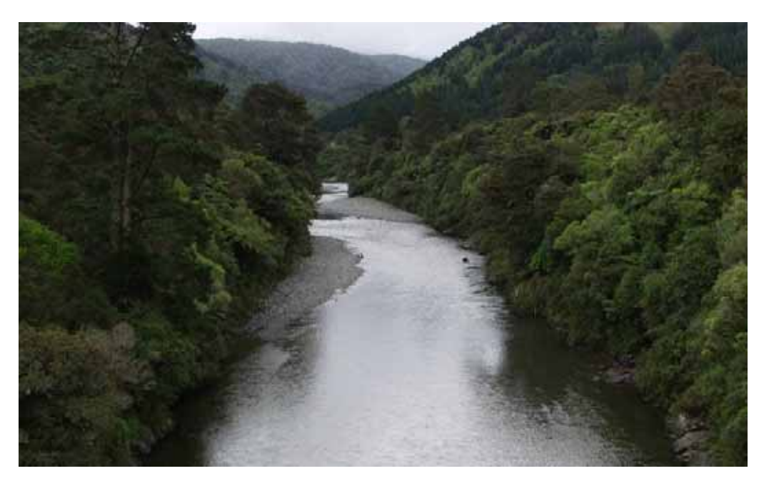
Figure 4.1: Waiohine River in the gorge

The upper reach of the Waiohine River is well-known for its scenic beauty (Figure 4.1). The Regional Policy Statement lists the Waiohine Gorge as regionally significant for its landscape and scenic qualities, and the RFP specifies that the river "upstream from the cableway" (the gorge reach and upstream) is to be managed in its natural state.