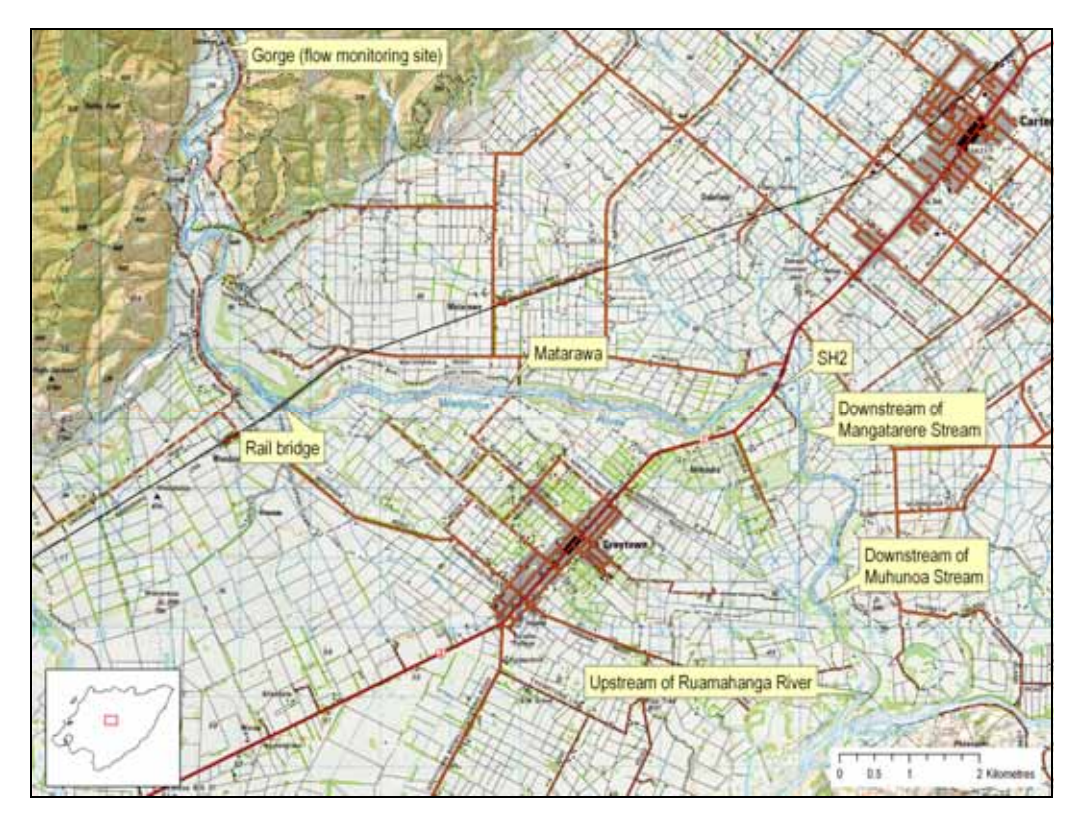
Figure 2.3: Locations on the Waiohine River for which low flow statistics have been estimated in Table 2.2