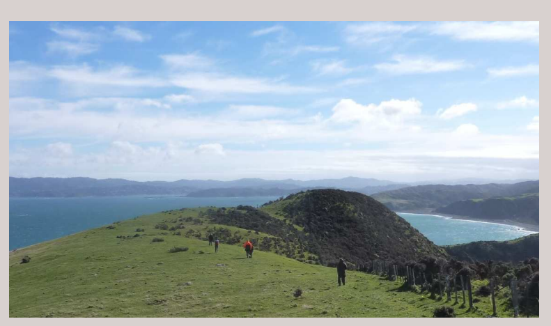
Baring Head, looking towards Wellington

The land has been purchased, a Friends group established, tracks developed... Baring Head will soon be open for everyone to enjoy