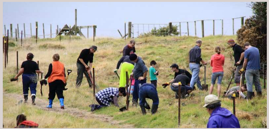
The community out in force to restore Onehunga Bay after the Whitireia Park fire

www.gw.govt.nz/onehunga-bay-restoration-group